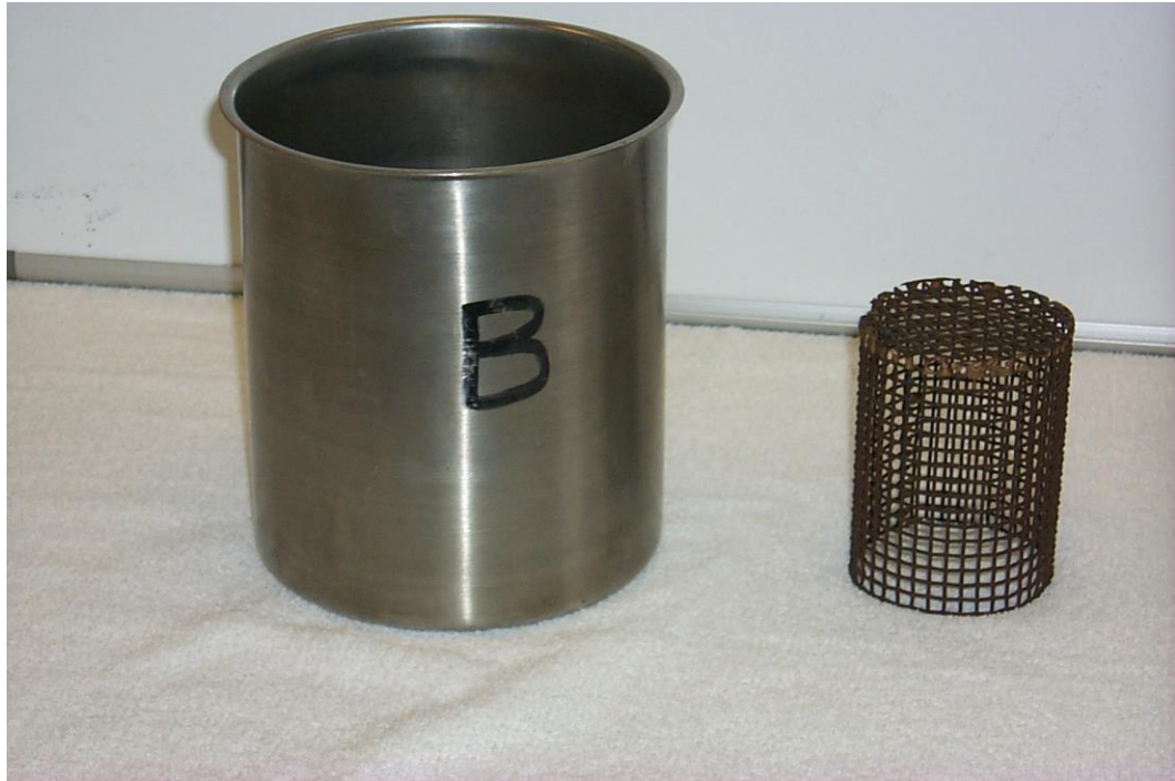
CONTAINER AND CYLINDRICAL MESH BASKET